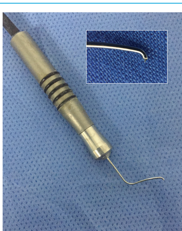
Figure 1. Capsulotomy “plug-on” tip for capsular phimosis. Inset: Close-up of the same device.