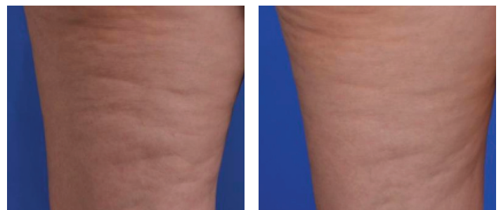
Before & after 3 treatments