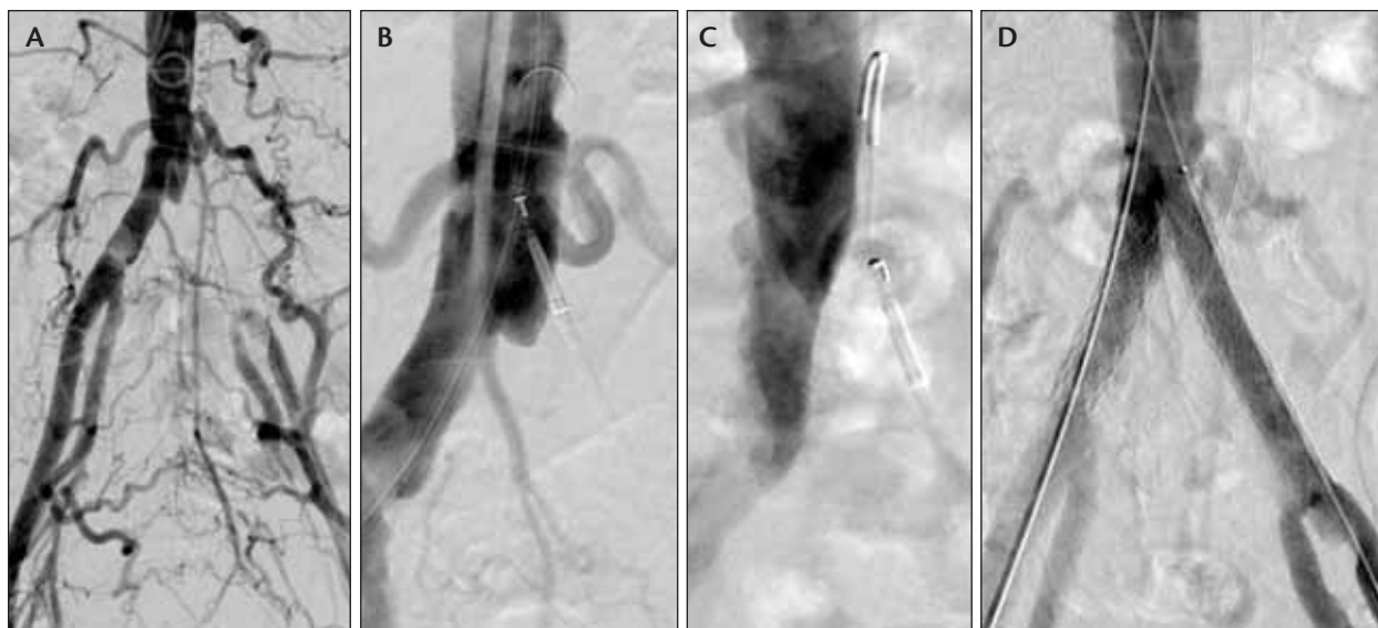
Figure 2. Occlusion of the left common iliac artery (A). An Outback catheter was inserted retrograde into the occlusion to enable reentry into the aortic bifurcation. The marker at the distal tip has to be brought into alignment to the artery forming a “T” where reentry of the guidewire is intended (B). The C-arm is then brought into a 90° position to the previous angiogram. In this position, the marker at the tip of the Outback catheter should form an “L” to direct the angled needle to the aortic bifurcation (C). Result after implantation of balloon-expandable stents in kissing technique into the aortic bifurcation (D).

important requirement but also a major challenge. Various techniques and approaches have been described, which all have advantages or disadvantages to achieve this goal. To facilitate reentry of the guidewire into the true lumen, specific reentry devices have been introduced, and the initial experience primarily obtained in the femoral arteries supports their clinical value (Figure 2). 7,8 Experience with these technologies in the iliac arteries is still somewhat limited, but they can certainly be very helpful tools in specific conditions. 9 One of the challenges when using these devices in a retrograde fashion to achieve reentry in the area of the aortic bifurcation is the difficult orientation given the complex three-dimensional anatomy. For this application, the Pioneer system may be preferable because it provides an intravascular ultrasound–based orientation that facilitates positioning of the device.