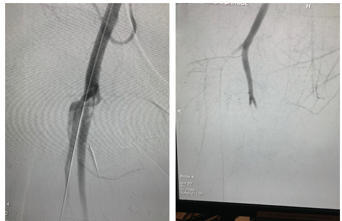
Figure 1. Baseline angiograms showing embolic burden in the SFA and secondary embolus in the tibial trifurcation.

The initial strategy was to use the 50 cm treatment zone EKOS™ Endovascular System and perform catheter-directed thrombolysis. The 5 Fr diagnostic sheath was exchanged for a 6 Fr, 45 cm length Pinnacle® Destination® Guiding Sheath. The distal tip of the EKOS™ catheter was placed in the mid posterior tibial artery and the proximal end within the CFA. Catheter-directed thrombolysis was then performed. The patient was admitted to the intensive care unit with a 1 mg/min tissue plasminogen activator (tPA) drip overnight. The patient was reexamined 24 hours later, and a repeat angiogram was obtained. There was minor improvement in the SFA and profunda artery. The popliteal artery also had minor