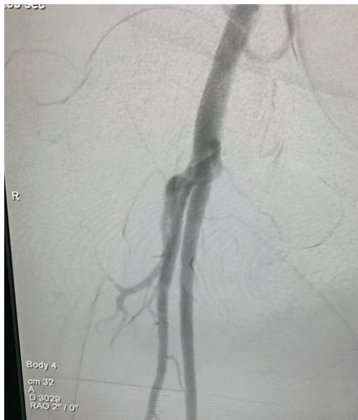
Figure 4. Patent SFA and profunda artery.