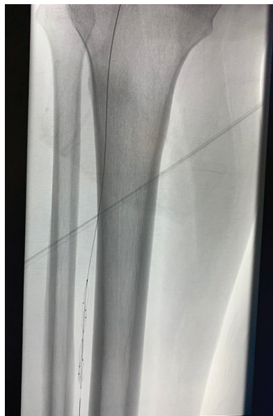
Figure 3. Pounce™ System baskets in distal posterior tibial artery.