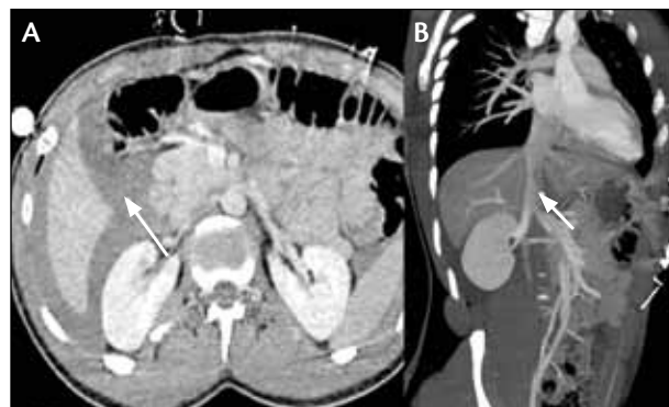
Figure 1. Preoperative CT angiography of the perihepatic hematoma (arrow, A), which had no sign of caval rupture (arrow, B).

A 23-year-old man was involved in a motorcycle-car crash. Upon admission to the emergency department, resuscitation therapies were carried out according to advanced trauma life support. He presented with mild hypotension (systolic blood pressure of 110/50 mm Hg) and tachycardia (102 bt/min). Blood tests revealed a hemoglobin level of 12.2 g/dL, platelet count of 78/mm 3 , GOT of 340 IU/L, GPT of 309 IU/L, and creatine kinase of 891 IU/L. Radiography showed bilateral pneumothorax and a right lung contusion. Total-body spiral CT revealed a contusion of the fourth and eighth hepatic