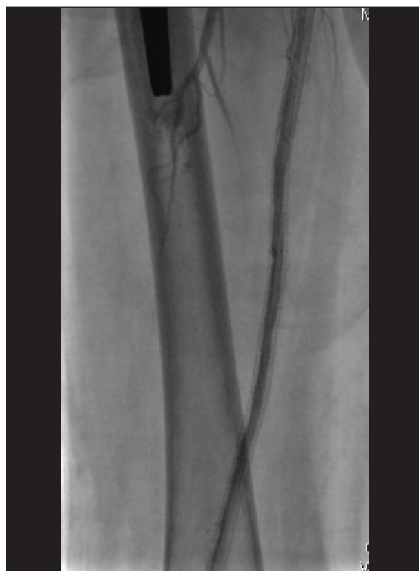
Figure 1. Full metal jacket of the SFA.

Despite the patency advantage of stent use compared to balloon angioplasty alone, we have come to recognize important limitations of using stents, especially for long-segment femoropopliteal stenting. Due to the mechanical forces seen in the femoropopliteal segment, stent fractures of standard nitinol stents have been