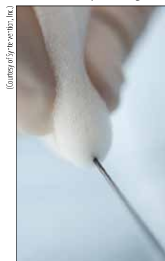
Figure 3. The Swiper in use shown wiping a guidewire. Note that this is used the same way as the currently used materials in the interventional lab (eg, gauze and nonadherent dressings).

Another consequence of foreign body contamination is thrombus formation. 1-4,10,16 Cotton fibers can cause local hypercoagulability. In an experimental model to assess coagulation in a setting relevant to angiographic procedures, Bookstein et al found that after wiping a guidewire and finding gauze powder or gauze lint, there was a marked acceleration of clotting within the catheter as measured by the activated clotting time. 17 Fischl et al reported a case of a patient who experienced chest pain after a diagnostic catheterization and procedure to assess fractional flow reserve in the left anterior descending (LAD) artery. 2 The result of the fractional flow reserve study was negative; however, after leaving the cardiac catheterization lab, the patient developed refractory chest pain and returned to the lab for further assessment. A filling defect was noted in the LAD, and aspiration thrombectomy was performed. The aspirate contained a thrombotic cotton gauze fragment measuring approximately 1.5 cm in length. The authors report that the gauze fragment was inad-