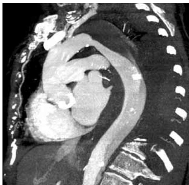
Figure 1. CTA of the chest showing a ruptured type B aortic dissection.

An alternative is the “chimney graft” technique, which involves placement of adjunctive stents in side branches of the aorta alongside the main endovascular stent graft. 6,7 In this article, we describe the successful endovascular treatment of a ruptured acute descending aortic dissection with the chimney TEVAR technique.