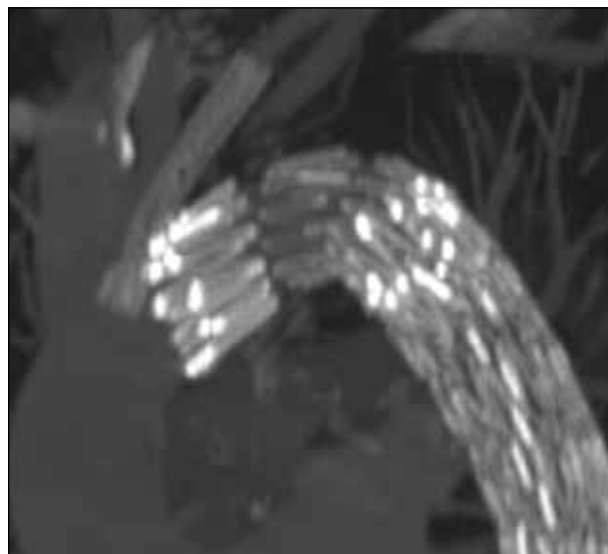
Figure 3. Postoperative computed tomography maximum-intensity projection image shows the correct position of the iCast stent in the left common carotid artery and the Zenith TX2 aortic endoprostheses.

This case report describes a patient with a ruptured descending aortic dissection that was successfully treated with the chimney TEVAR procedure. The chimney TEVAR technique was required to create a good proximal seal, which required coverage of the left common carotid artery and left subclavian artery by the aortic stent graft. This chimney TEVAR technique allows exclusion of challenging aortic pathology from blood flow and continued adequate blood flow into the side branches of the aorta that are covered by the aortic endograft. Other advantages are that readily available stents can be used and that the technique provides an