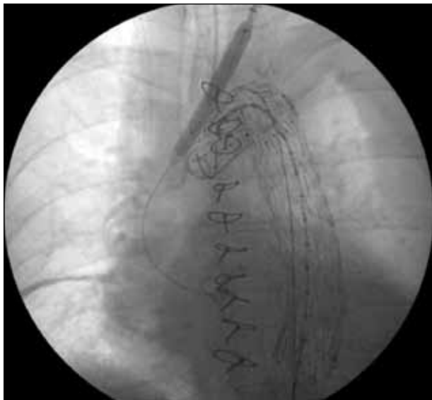
Figure 2. Intraoperative fluoroscopy shows deployment of a balloon-expandable iCast stent across the ostium of the left common carotid artery and parallel to the Zenith TX2 endoprosthesis.

ruptured Stanford type B aortic dissection with a left-sided hemothorax (Figure 1). Because of her age and comorbidities, she was not an appropriate candidate for open therapy. She was emergently planned for endovascular repair in the operating room.