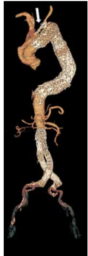
Figure 4. Aortic arch hybrid. The left common carotid artery was reconstructed with a hybrid graft (arrow).

involves the subjection of the vessel wall to turbulent flow related to the abrupt geometric change at the anastomosis. 3,4 Additional anastomotic turbulence is produced as a result of the mismatch in the compliance between the native vessel and relatively rigid graft material.