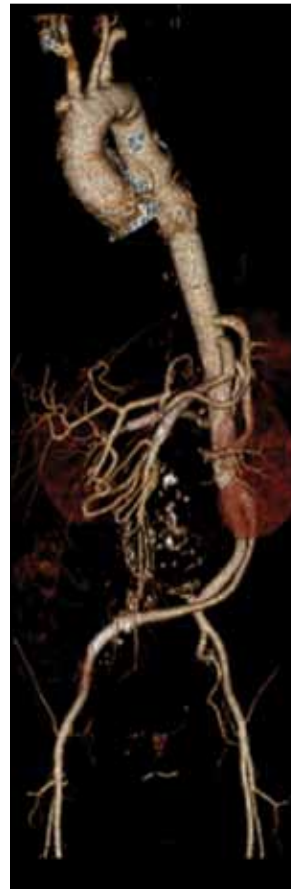
Figure 3. Extent III TAAA repair. Hybrid grafts were placed in the SMA, bilateral renal arteries, and right external iliac artery.

The proposed mechanism of vascular graft failure involves a complex pathway of shear wall stress, smooth muscle cell activation and proliferation, neointimal thickening, neointimal hyperplasia, stenosis, and, ultimately, thrombosis. 2 A leading hypothesis