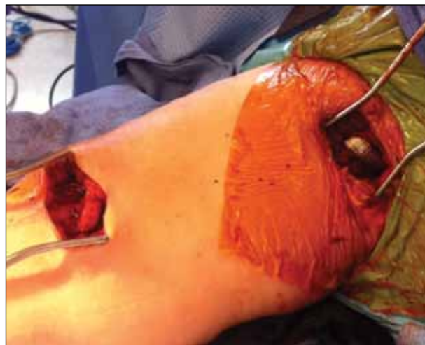
Figure 2. Dialysis access. Completion of the right brachial artery-to-brachial vein vascular access procedure using a hybrid graft.

Next, the proximal right external iliac artery was cannulated with the stent portion of a 9-mm Gore Hybrid vascular graft, and the PTFE portion of the graft was then anastomosed to the distal end of the Dacron graft. As this was a left retroperitoneal approach, the hybrid graft made anastomosis to the right external iliac artery much easier by circumventing the need to sew an anastomosis deep in the contralateral pelvis in a large patient. The left iliac was reconstructed in a standard manner. Tacking sutures were placed in all hybrid anastomoses, as these were end-end reconstructions. A three-dimensional reconstruction of postoperative computed tomographic angiography is shown in Figure 3. In this case, use of the hybrid graft decreased isch-