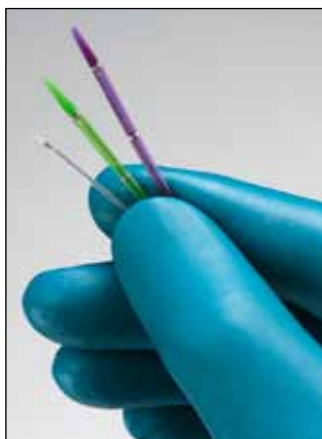
Figure 1. Distal tips of the AngioJet Solent Dista, Proxi, and Omni peripheral thrombectomy catheters (Bayer Radiology and Interventional, Indianola, PA).

Dr. Wang: I tell patients, "You have a thrombus in this location, and as extensive as you have it, two-thirds of patients will do fine on anticoagulation, but one-third will have a chronically swollen or even ulcerated leg." I explain that endovascular therapy can reduce the chance that they will develop chronic pain or ulcerations, but there is some risk with the procedure. I tell them that approximately 2% will bleed from the procedure. I tell them that the bleeding can happen anywhere; if it happens at the access point, that is easily controlled. However, if you bleed into your head, that can be a potentially fatal situation. I also tell them that even though there are risks to endovascular therapy, your risk of bleeding on long-term anticoagulation alone is higher. I tell all my patients this, and their reaction and decision depends on how painful or swollen their legs are. If a