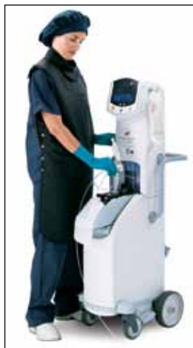
Figure 3. The AngioJet Thrombectomy System console energizes the thrombectomy catheter, displays run times for thrombectomy procedures, and shows infusion amounts for Power Pulse delivery.

Dr. Shishehbor: There are little data regarding embolization to the lungs during endovascular therapy. I typically do not use an IVC filter because the risk of PE is low and because of the risk and cost associated with the filter (with no proven benefit). After the procedure, we wrap the legs and keep them elevated. Patients are usually