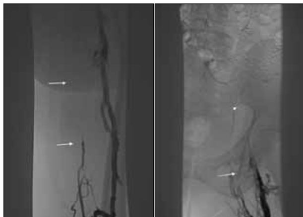
Figure 1. Initial venogram demonstrates occlusion of femoral, CFV, and iliac veins (arrows) with ligation clip (arrow-head).