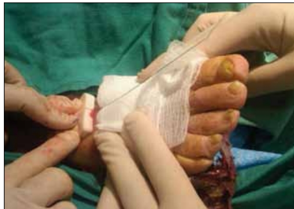
Figure 3. Pedal access using the dorsalis pedis.

Other than this balloon, atherectomy devices, stents, and other balloons will not reach due to the shorter shaft length. If other treatment modalities are warranted, retrograde wire access must be converted to an antegrade access. To cross from above, a wrapping wire technique may be performed. This technique wraps the antegrade wire around the retrograde wire in a coiling fashion following the retrograde wire path. A second option is using a snare to pull the retrograde wire through the antegrade access. Sometimes, this technique may be difficult because of the increased forces applied to the retrograde wire secondary to tortuosity and the small caliber (2 mm or less) of the distal tibial vessels. To overcome the tension on the transcollateral wire, the use of a support catheter is recommended during the snaring process. These techniques may be utilized through other collaterals below the knee and for collateral access above the knee (ie, profunda collaterals into the superficial femoral artery).