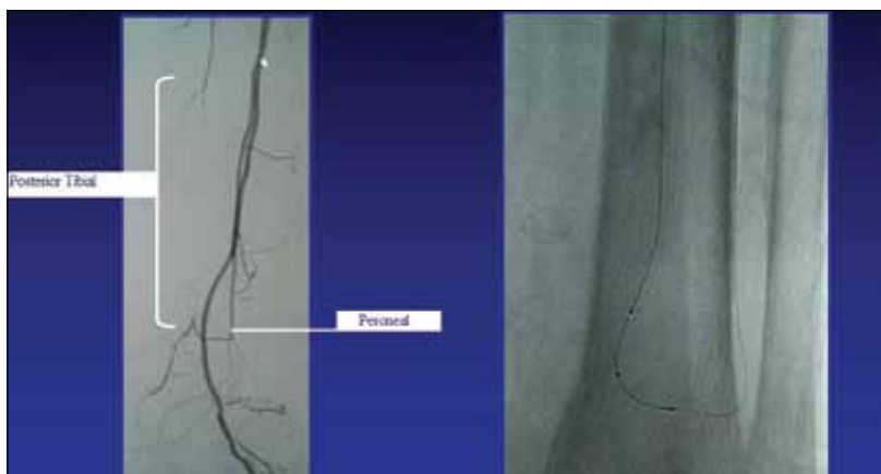
Figure 2. Retrograde approach using a peroneal collateral.

When addressing infrapopliteal calcified CTOs, the antegrade approach has traditionally been considered first. A multitude of CTO wires and catheters have been developed specifically for crossing this challenging diseased segment. CTO wires that are used in the infrapopliteal segment are 0.014 or 0.018 mm in diameter, with loaded tips ranging from 3 to 30 g. Higher levels of calcification present in some occlusions require more body to a wire, which is accomplished through a larger diameter and a greater loaded tip. Additionally, specialized hydrophilic and/or tapered wires may be utilized for crossing through microchannels and drilling through calcific plaque. Multiple wires meet these requisites, and selection is usually guided based on the operator's level of comfort and experience.