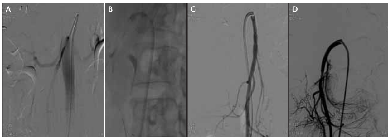
Figure 1. Patient with chronic mesenteric ischemia and high-grade superior mesenteric artery (SMA) and celiac artery stenoses. Selective catheterization was performed with a reverse-curve catheter through a long guide catheter (A). Initial 4-mm PTA was performed over an 0.018-inch wire (B). Despite predilation, the balloon-expandable stent would not advance across the stenosis. Two 0.014-inch buddy wires were placed alongside each other to facilitate delivery of the balloon-expandable stent (C). Angiogram after successful stenting of the SMA origin shows a widely patent SMA with markedly improved filling of distal jejuna and colic branches (D).

significant ostial stenoses, a cobra catheter may not afford sufficient purchase for subsequent angiography and/or intervention. Difficulty engaging the targeted artery may also be secondary to the presence of atherosclerotic aortic disease, iliac tortuosity, and abdominal aortic aneurysm. In many of these cases, a reverse-curve catheter is preferred. We often use a Sos Selective (AngioDynamics) or Simmons catheter (Figure 1A). The vessel is then selected primarily with either a small- (0.014 or 0.018 inch) or large- (0.035 inch) platform guidewire.