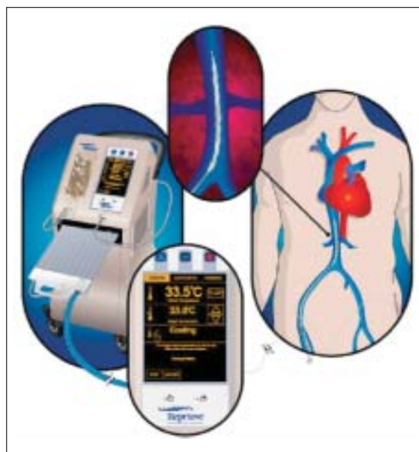
Figure 2. The Radiant Medical (Redwood City, CA) Reprieve Endovascular Temperature Therapy System.

Trials with endovascular hypothermia have revealed it to be a technique that, when compared with traditional surface cooling methods, has the capability for more rapid tar-