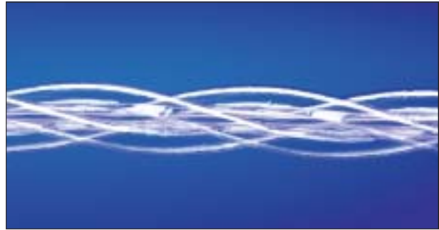
Figure 4. A close up of the Reprise catheter.

attained and then precisely maintained, rewarming can be controlled, and a more homogenous response to treatment can be obtained. ■