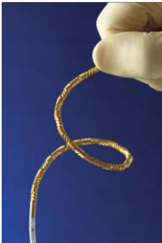
Figure 3. The Celsius Control catheter.

The benefits of acute therapeutic hypothermia in conditions that result in both focal and global cerebral ischemia have become increasingly evident, as have its feasibility and safety. 10,12,13 With this realization, the endovascular technique holds promise as a modality in which a target temperature can rapidly and accurately be