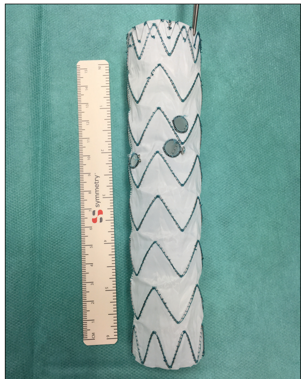
Figure 4. A PMSG with four fenestrations for all visceral vessels based on the 3D hollow aortic model.

strut-free area of the stent graft (Figure 3). The locations of the four openings are marked with a sterile pen, and the graft is removed from the template. Using a surgical scalpel, two 8-mm fenestrations are created for the origin of the celiac trunk and superior mesenteric artery (SMA), and two 6-mm fenestrations are created for the renal arteries. All fenestrations are reinforced with 6-0 Ethibond sutures (Ethicon, a Johnson & Johnson Company) and radiopaque markers using the tip of a V-18 ControlWire guidewire (Boston Scientific Corporation). The lateral "8" markers are removed from