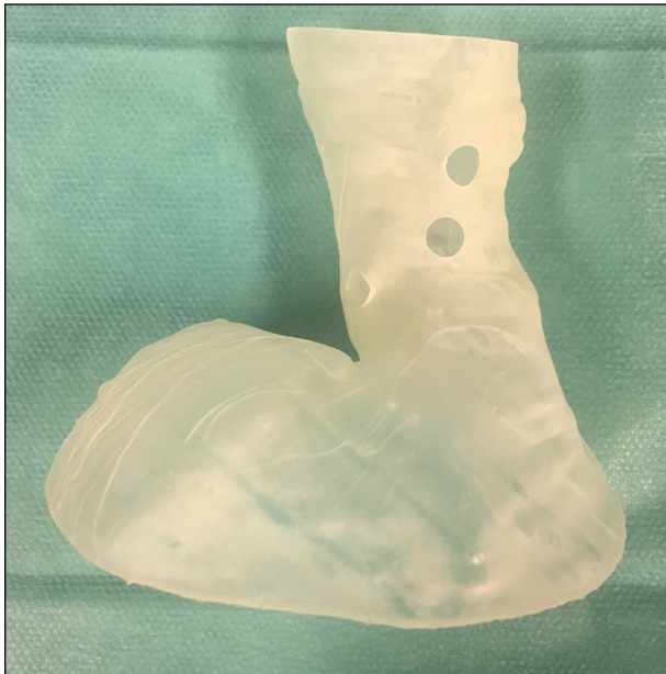
Figure 2. A 3D-printed biocompatible aortic model of the proximal neck of the juxtarenal aortic aneurysm.

Mimics 16.0 and 3-matic 6.1 software (Materialise NV) that replicates the acute aortic pathology, as well as the proximal and the distal landing zones of the aorta. Round openings that are 6 mm in diameter are planned at the locations of the branch vessel origins (Figure 1). We use the Form 2 3D printer (Formlabs, Inc.), which is based in our hospital, to produce a clear, rigid model made from biocompatible Dental SG resin material (Formlabs, Inc.) that includes 6-mm holes at the locations of visceral vessels (Figure 2). The inner lumen of the model is planned to have the same diameter as the aorta. The thickness of the wall of the aortic model is 1 mm. Finally, the 3D aortic model is sterilized using steam pressure. According to our experience, the total manufacturing time of the unsterile 3D aortic model is approximately 6 hours.