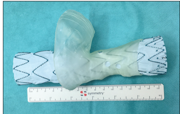
Figure 3. A stent graft placed inside the sterilized 3D biocompatible aortic model in order to mark the fenestrations.

Exclusion of the acute complex abdominal or thoracoabdominal aortic pathology is performed in a hybrid room under general anesthesia and with percutaneous access. Most of the time, we choose a 150-mm-long Valiant Captivia closed-web thoracic stent graft (Medtronic) with 20% oversizing over the proximal aortic neck as a base for the PMSG. On a back table, the Valiant Captivia closed-web thoracic stent graft is introduced into the 3D-printed biocompatible aortic model, unsheathed, and completely deployed into the model. Under direct visualization, the stent graft is rotated so that the fenestrations are localized in a