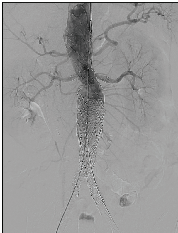
Figure 6. Final angiography showing complete exclusion of the symptomatic juxtarenal aortic aneurysm after urgent implantation of a PMSG with four fenestrations manufactured based on a sterile biocompatible 3D model of the patient's aorta.

The endovascular treatment of complex abdominal and thoracoabdominal aortic pathologies requires complex, patient-specific planning based on the centerline of the aortic flow. Reliable graft planning can be performed using 3D aortic models based on the raw CTA data from the patient. Furthermore, after