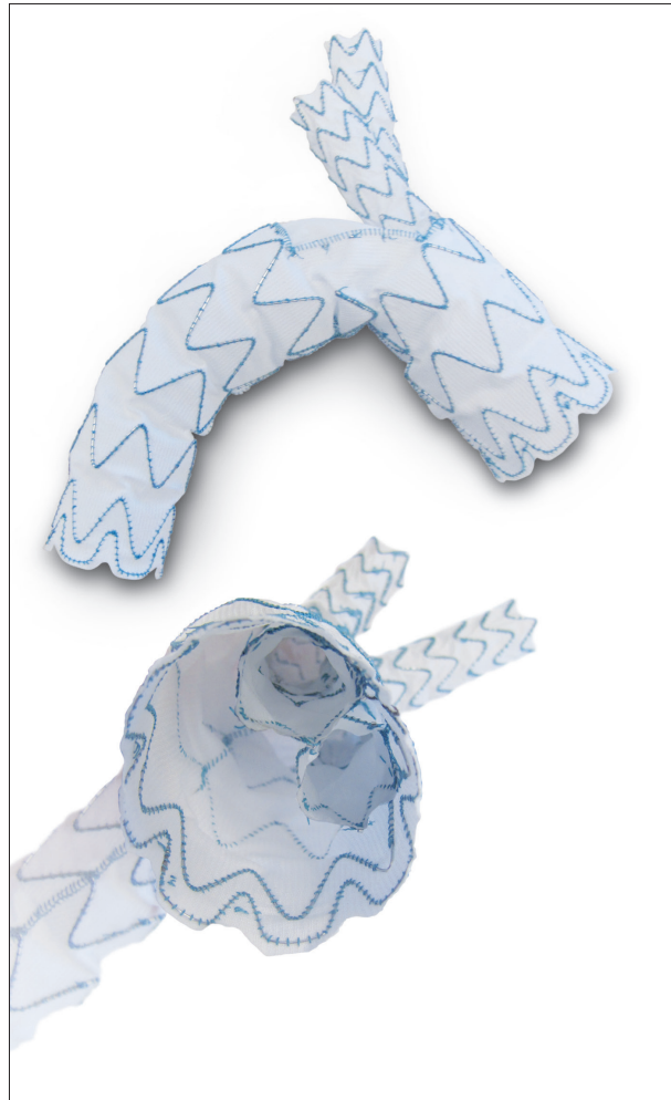
Figure 4. The Bolton Medical dual-branch aortic arch stent graft.

For aortic repair, Bolton Medical offers the infrarenal Treovance and Treo stent grafts, as well as the Relay Thoracic endograft. Based on these platforms, the company has the possibility of supplying custom-made devices for the abdominal and thoracic aorta and the aortic arch. The Bolton Medical dual-branch aortic arch stent graft has a large opening on the convex portion of the graft, which serves as the external opening for two internal branches in the main stent graft (Figure 4). It has a fixed configuration with locking barbs in both internal tunnels to prevent component disconnection and migration. The preliminary results of the global experience of this stent graft in 26 patients showed a perioperative mortality of 11.5% and a stroke rate of 3.5%. 10 Further publications and details regarding the outcomes are awaited.