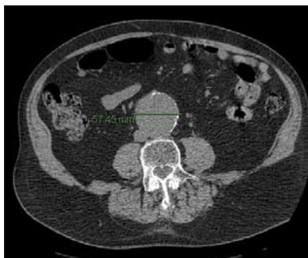
Figure 1. Preoperative CT of an 87-year-old man with a 5.6-cm AAA.

Due to the incidence of endoleaks and device-related complications, EVAR patients require lifelong surveil-