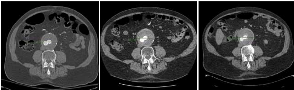
Figure 3. Surveillance CTA at 6-month intervals shows persistent aneurysm growth with no identifiable endoleak.

Blood pool contrast agents bind to albumin, resulting in longer serum half-life and enabling late-phase MRI. Cornelissen et al utilized a weak albumin binder, gadofosveset trisodium, to perform MRI in patients with continued aneurysm sac growth without endoleak on CTA. Thirty-minute delayed MRI revealed type II endoleaks in six of 11 patients (55%), with no endoleaks on CTA. 10 However, MRI has its own limitations: not all endografts are compatible with MRI, not all patients can undergo MRI, the equipment is not always readily available, and studies have not yet confirmed improved outcomes of EVAR due to the early detection of the endoleaks and more extensive identification of feeding vessels. 10