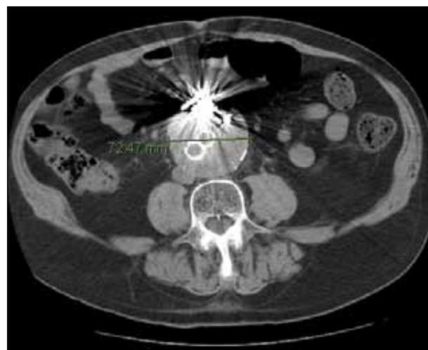
Figure 5. Surveillance CTA after embolization showing aneurysm shrinkage.

suggest that such treatment is not warranted due to the low incidence of type II endoleaks with aneurysm sac growth coupled with the risks and costs of preemptive treatment. 4 The clot engineering concept for prevention of type II endoleaks will lead to future research in the field of biomaterials and polymers. 21