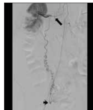
Figure 2. Ovarian artery arising from right renal artery (long arrow). The ovarian connection to the uterine supply is demonstrated at the level of the uterus (short arrow).

arteriography. The RIM catheter or the Sos Omni catheter (AngioDynamics, Inc., Queensbury, NY) are also common choices. The ovarian arteries typically arise from the anterior aortic wall a few centimeters below the renal arteries (Figure 1A), 12 although in a small number of patients, it may arise from a renal artery (Figure 2). The catheter is used to search the anterior wall of the abdominal aorta, using intermittent small injections of contrast material to identify the vessel origin. With contrast opacification of the ovarian artery origin, the tip of the catheter can be guided gently into the vessel. The ovarian artery commonly takes an abrupt upward change in course just after its origin, so the catheter should not be advanced beyond the first few millimeters.