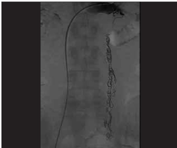
Figure 2. Postembolization venogram showing no further reflux in the ovarian vein.

care physicians. Computed tomography (CT) scans are often ordered for abdominal pain, which show venous varices in the area of the uterus or in the pelvis. In addition, careful review of the images often shows a large, dilated ovarian vein. Once the possible diagnosis of PCS has been raised, patients are often referred for further evaluation.