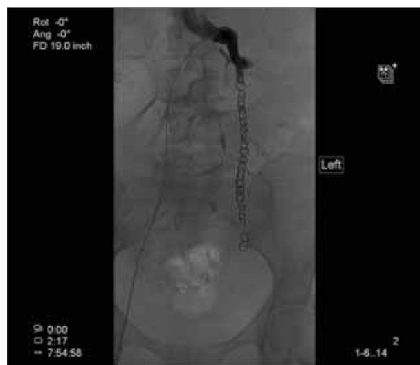
Figure 4. Selective imaging of the left ovarian vein after embolization that shows the coils in place and no further reflux into the pelvic varices.

Endoluminal interventions are divided into either sclerotherapy or transcatheter embolization. Both are equally successful in the symptomatic management of PCS and can be combined in some cases. The performance of both procedures begins with retrograde ovarian vein venography as previously described. If ovarian vein reflux is identified, a Glidewire (Terumo Interventional Systems,