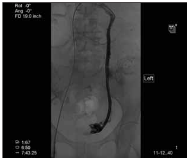
Figure 3. Venographic images of the left ovarian vein showing a dilated ovarian vein and the free reflux of contrast into pelvic varices.

This is a noninvasive test that is performed either transvaginally or transabdominally, often in the gynecologist's