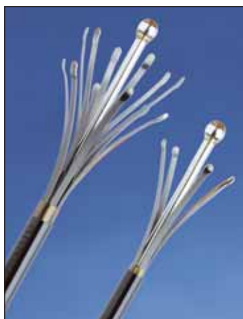
Figure 1. First-generation ClosureFast 1-cm treatment length.

Eliminating an incompetent great saphenous vein (GSV) reduces venous hypertension, relieves patient symptoms, and prevents or slows the disease progression. However, GSV ablation alone is usually not sufficient for elimination of all existing varicose veins. 2 Complete care of the patient with varicose veins requires adjunctive therapy; the two most common procedures are phlebectomy and ultrasound-guided sclerotherapy (UGS). Phlebectomy allows simple removal of bulging varicose veins on the skin surface