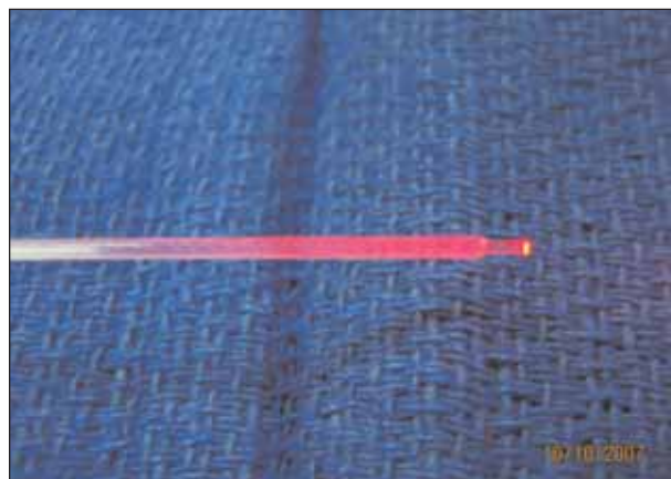
Figure 3. Bare laser fiber.

The first-generation RF device was slowly losing market share because it was less effective and more cumbersome to use than the more nimble endovenous laser products. In May of 2007, VNUS Medical Technologies, Inc. (San Jose, CA) launched their second-generation radiofrequency ablation product called ClosureFast (Figure 2) at the annual International Vein Congress (IVC) in Miami. ClosureFast has shortened the catheter pullback time from 20 minutes to about 3 minutes with little postoperative discomfort. No data are yet available as to whether primary closure rates