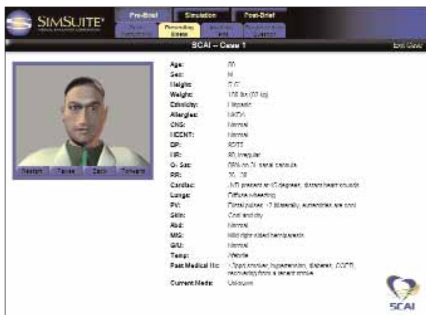
Figure 1. The case introduction screen.

A review by Gallagher and Cates acknowledges the importance of obtaining metrics that separate novices from experts. They note that “An optimum approach to