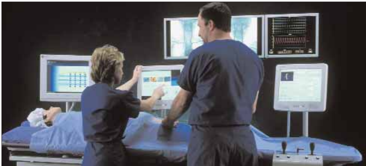
Figure 2. The simulated catheterization laboratory.

using simulation for training would be to first establish an objective benchmark on the simulator, based on the performance of experienced operators. 17 The Society for Cardiovascular Angiography and Interventions (SCAI) agrees and is developing a program for percutaneous coronary intervention.