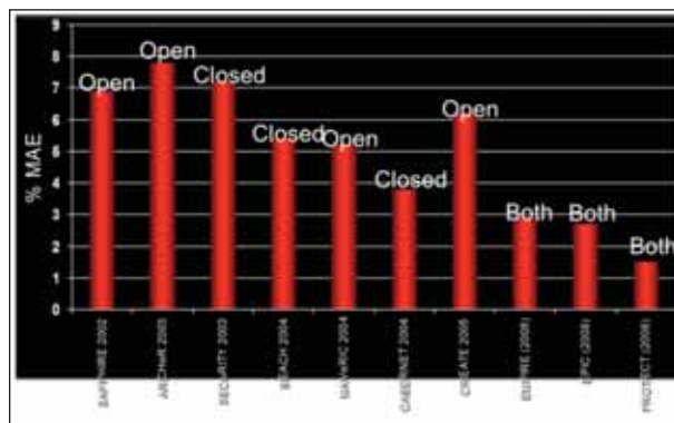
Figure 1. Outcomes of US trials over time according to the type of stent (open cell or closed cell) tested.

The nonclinical evidence of a difference in stent design is also very weak. The surrogate outcome measures of transcranial Doppler (TCD) and magnetic resonance imaging diffusion-weighted imaging (MRI DWI) abnormalities have no proven clinical correlative value.