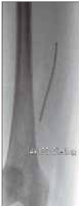
Figure 2. A Sterling balloon is advanced and inflated at the occlusion site.

After administration of bivalirudin, an .018-inch, V-18