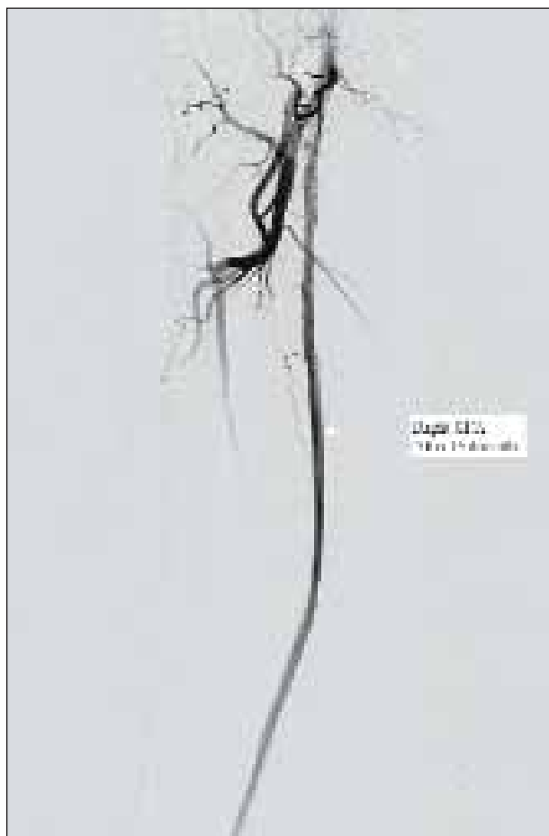
Figure 4. Final angiogram showing widely patent right SFA after percutaneous intervention.

Several techniques employed in this case warrant a brief discussion. Frequently, when a heavily calcified lesion is encountered, it is necessary to exchange for a .035-inch wire or to utilize a guide catheter for additional support in crossing the lesion. However, in this case, an attempt was made to cross the occlusion using only a wire and a PTA balloon. The Sterling balloon catheter was selected because its ultra-low profile would enable us to proceed with an endovascular approach. Furthermore, the balloon's tapered tip may provide an added advantage over a Glidecath Catheter (Terumo Medical Corporation, Somerset, NJ) in its ability to advance through subtotal occlusions.