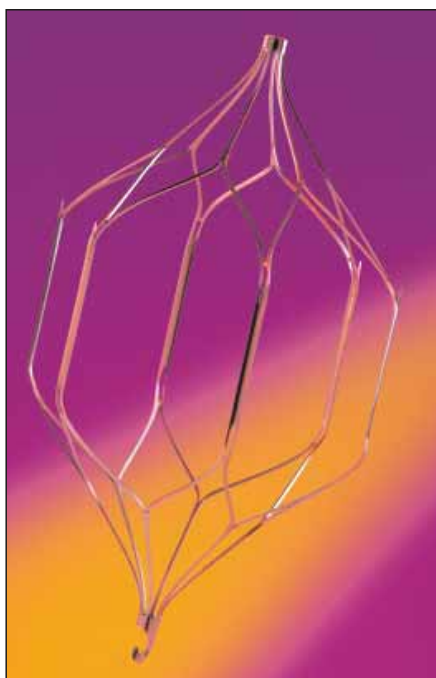
Figure 3. The OptEase filter.

As with any indwelling prosthesis, IVC filters can be subject to infection. Strict aseptic technique should be maintained during the insertion of IVC filters. One case of septic death was reported from a filter placed using a previous central venous line access, rather than a de novo percutaneous puncture. 35