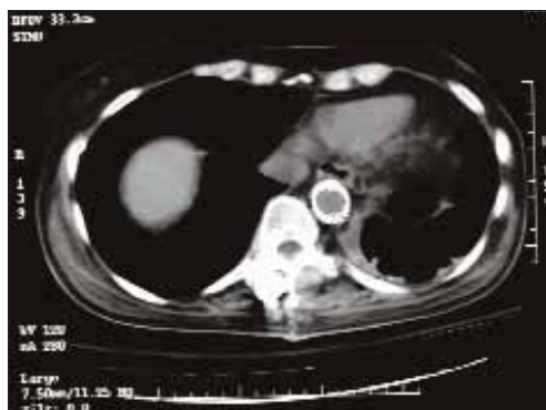
Figure 6. CT scan demonstrates stability of the spine and acceptable position of the stents without evidence of a leak.

We present a case of endovascular repair of the aorta after iatrogenic injury via a spinal procedure. Early intervention and a coordinated plan between all the services helped increase the chance of successful removal of the pedicle