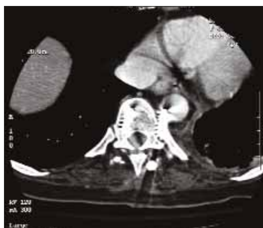
Figure 1. CT scan shows the left lateral interpedicular screws protruding into the posterolateral aspect of the aortic lumen at the T12-L1 level. Although periaortic hematoma is not visualized, penetration into the lumen cannot be excluded.

The patient was then moved into a right lateral decubitus