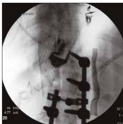
Figure 4. Angiography demonstrates both stents in the aorta after removal of the two screws.