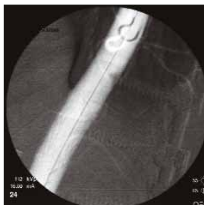
Figure 5. Final angiogram reveals no evidence of a leak.