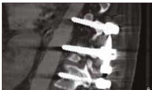
Figure 2. Magnetic resonance imaging reveals screws impinging on the aorta.

The patient tolerated the procedure well and was extu-