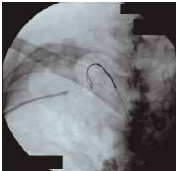
Figure 2. Baylis RF PowerWire being passed through the occlusion in the plane of the retrieval snare.

and chronic CVOs. 5 We are using the RF PowerWire in patients with chronic CVOs who had failed recanalization using conventional wire and sharp recanalization techniques. We have had an 84% success rate in a series of prospective patients in which aggressive conservative techniques have failed.