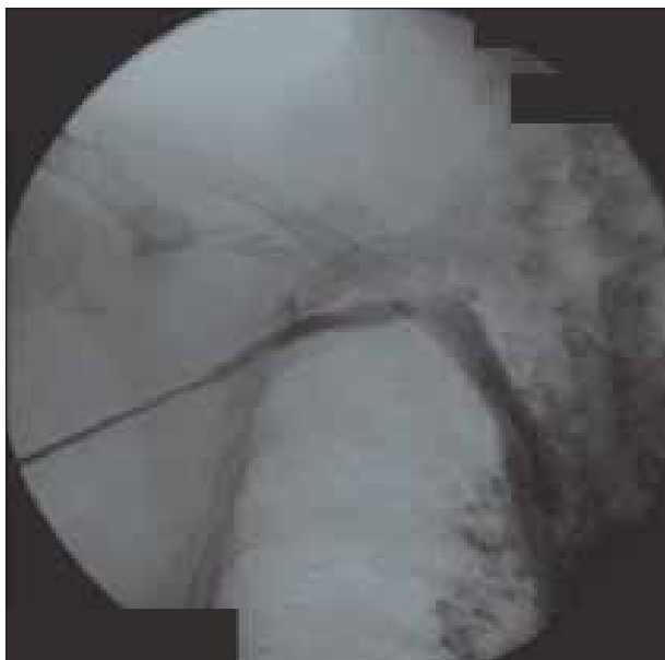
Figure 4. SVC angiogram demonstrating recanalization of the right brachiocephalic vein with absence of collaterals.

in patients with ESRD. 3,6 Unfortunately, many centers have come to view central venous catheters as a “necessary evil” because many patients commencing hemodialysis require immediate treatment despite lengthy maturation times for an arteriovenous fistula. 3