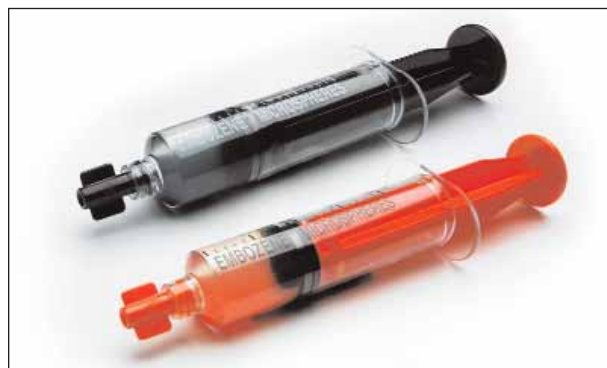
Figure 1. 100- \mu m Embozene™ Microspheres (orange) and 40- \mu m super-selective Embozene™ Microspheres (black).

older embolic agents that clumped and aggregated and occluded the main feeders of the tumor.