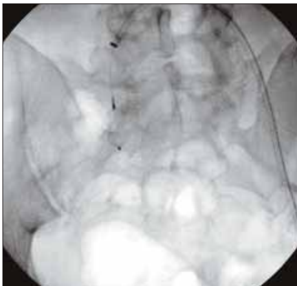
Figure 2. Deployment of the Amplatzer Vascular Plug ([AVP] AGA Medical Corporation, Plymouth, MN) in the right hypogastric artery using a contralateral femoral approach.

stent graft in both the external iliac and hypogastric arteries. 14 The focus of this article, however, will be on embolization techniques for occlusion of the hypogastric artery by coil and vascular plug deployment.