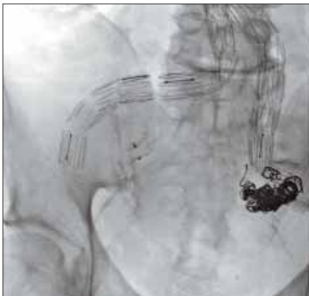
Figure 4. Deployment of AVP in the right hypogastric artery after coiling of the left hypogastric artery. Note the difference in the number of devices used.

precision in the most proximal internal iliac artery and tend to slide downstream more often than not, occluding, in some cases, the early branches of the artery. This hinders collateral flow to the hypogastric bed and could be the reason that coil embolization may have a higher rate of ischemic complications compared with plug placement, which can be done with controlled precision.