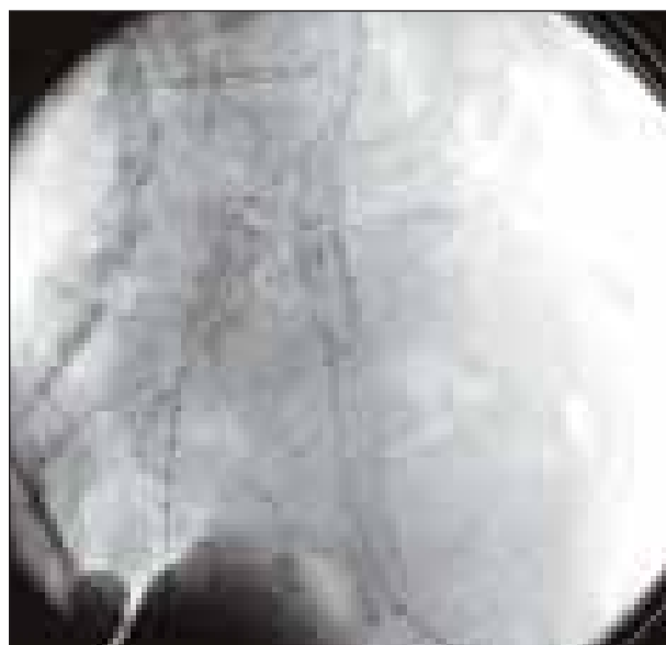
Figure 3. Deployment of the AVP to embolize the right hypogastric artery to permit deployment of a right iliac stent graft for exclusion of an isolated common iliac aneurysm.