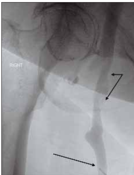
Figure 1. The 5-F catheter (arrow) has been brought into the proximal GSV, and a venogram depicts the saphenofemoral junction (split arrow).

An embolization coil (Nester Embolization Coil, Cook Medical, Bloomington, IN) is then placed into the tributary for anchoring and then curled up in the GSV. On average, two additional coils are then placed adjacent to this coil or until complete occlusion of the saphenous vein has been obtained (Figure 3). This is done using fluoroscopic guidance. Subsequently, 5 to 10 mL of absolute alcohol is injected into the vein peripheral to the coils as the catheter is pulled to the introducer sheath. The patient is then instructed to wear a full-length compression stocking (30 to 40 mm Hg) for 3 days and nights and then for 5 weeks during the day. When indicated, bilateral procedures can be done in the same sitting, and the patients can resume their normal