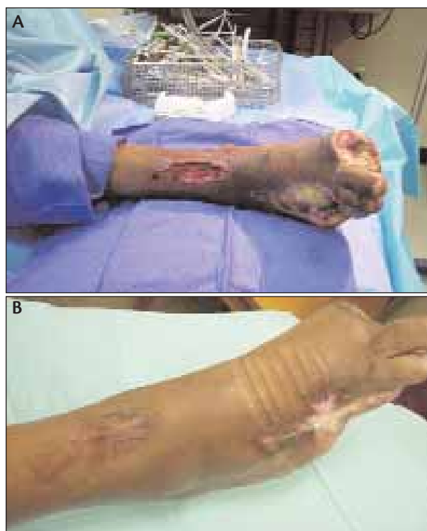
Figure 1. Rutherford class >6 scheduled for amputation after multiple failed surgical and nonsurgical attempts (A). Results 2 months after successful infrapopliteal laser/PTA, bioengineered skin substitutes, hyperbaric oxygen therapy, and maximal medical therapy for microcirculatory dysfunction (B). The multidisciplinary referrals and communication among podiatry, orthopedic, diabetes, plastic surgery, nursing, nutritional, and wound care specialists are additional integral components of the limb salvage toolbox are not comprehensively reviewed in this article but hopefully will be covered in future issues.

The podiatrist, wound care specialist, or referring primary care physician most often makes the clinical diagnosis of CLI due to a poorly healing wound. It is incum-