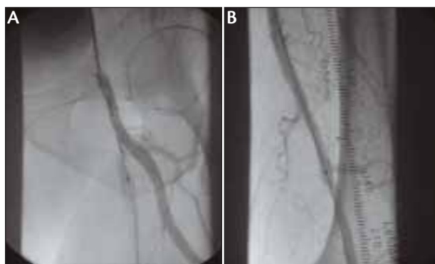
Figure 2. Image showing ostial SFA plaque excision with the SilverHawk LS-F plaque excision catheter (A) and distal Viabahn stent graft placement (B).

extended to the proximal landing zone. Finally, an 8-mm X 80-mm Powerflex P3 balloon catheter (Cordis Corporation, a Johnson & Johnson company, Miami, FL) was used to post-dilate the stent grafts to 10 atm yielding an excellent angiographic result (Figure 3A, B). Images of the tibial arteries showed no change from the initial diagnostic angiogram. Postprocedure ABI was 1.0, with no elevated velocities throughout the stent graft.