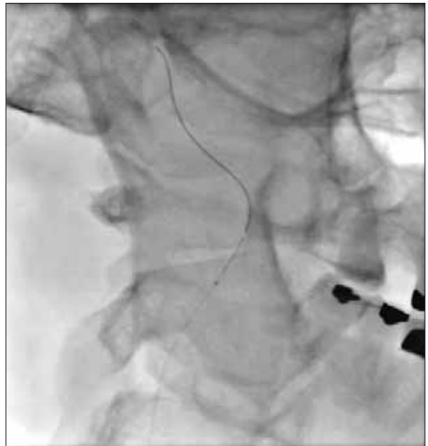
Figure 4. A fluoroscopic image showing the deployed filter.