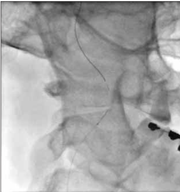
Figure 3. A fluoroscopic image showing the undeployed filter.

Dr. Bacharach: I believe the FiberNet compares quite