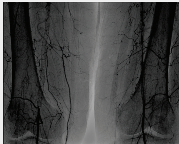
Figure 1. Diagnostic angiogram showing an occluded left SFA stent and extensive disease in the left SFA.

We exchanged out for a 0.014-inch wire and performed mechanical atherectomy using a 2.4-mm Jetstream™ device (Bayer). Intravascular ultrasound revealed that the vessel size was 5.4 mm. We predilated the occlusion with a 5-mm Vascutrak® PTA Catheter (Bard Peripheral Vascular, Inc.) in