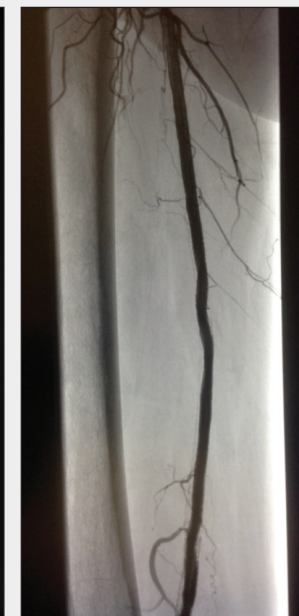
Figure 3. Completion angiogram after successful treatment with atherectomy, balloon angioplasty, and stenting.

at a rate of 19% to 37% at 1 year. 3-6 Secondary interventions for nonocclusive restenosis include the use of repeat balloon angioplasty, cutting-balloon angioplasty, repeat stenting with either a bare-metal stent or covered stent, and atherectomy. Secondary interventions for CTOs can be more problematic. In our experience, restenotic occlusions tend to be quite fibrotic. In addition, the cap of the occluded lesion can sometimes be severely calcified, especially in patients with diabetes or end-stage renal disease.