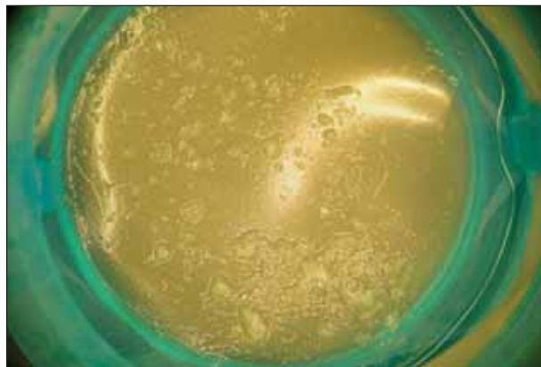
Figure 3. Debris caught in the aspirate using FiberNet EPS.

Interestingly, in this author's institutional experience, inspection of aspirate samples after CAS performed with FiberNet protection has yielded a larger debris burden on average when compared with other neuroprotection devices. Moreover, we have yet to see any filter occlusion despite the small pore size.