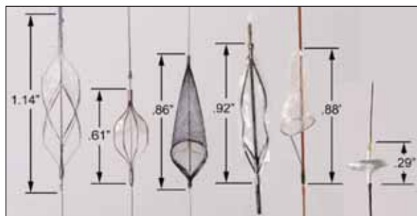
Figure 2. Comparison with other distal protection devices.

The FiberNet EPS is a new distal protection device that has the capacity to capture small embolic debris while providing continual cerebral perfusion. The device allows for good deliverability with a low profile, flexibility, and a short landing zone. The 360° apposition of the vessel wall demonstrated a higher number of embolic particles and debris removed compared to other filters. The retrieval catheter delivers suction during the filter retrieval, removing the captured or contained embolic particles inside the stent or between the stent and filter.