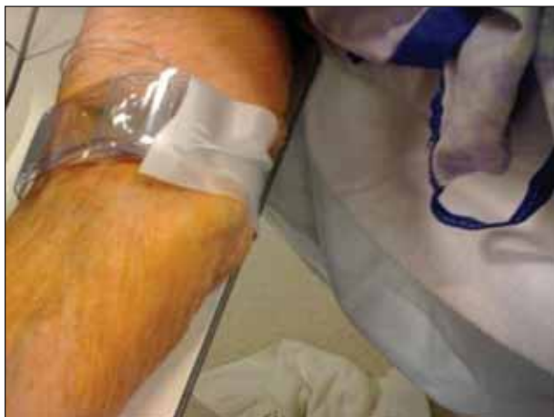
Figure 4. Right brachial placement of the TR Band with precautionary placement of silk tape.

immediate reinflation. We leave the arm board in place overnight to keep the elbow straight and remove it after inspection the next morning.