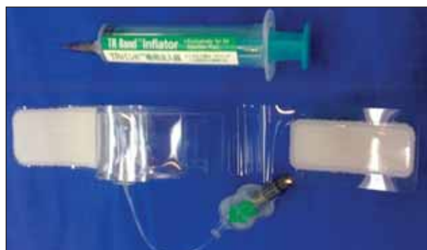
Figure 1. TR Band radial compression device.

Typically, in interventional cases, the band is loosened by removing 5 mL of air at 4 hours and is deflated completely 1 hour later. However, it is often left in place for another hour in case of breakthrough bleeding and the need for