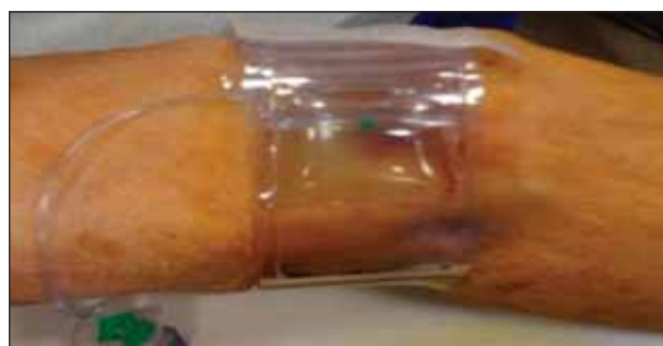
Figure 2. Right brachial placement of the TR Band.