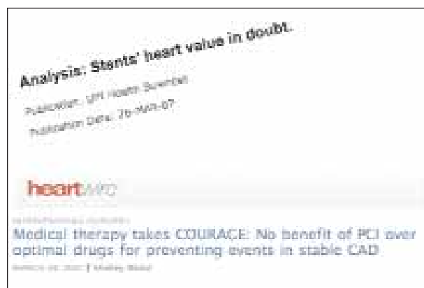
Figure 1. An example of a title that sensationalized COURAGE and did not allow for more rational scientific discussion.

Therefore, because all of the patients in the trial were catheterized, one cannot draw conclusions from the trial results about when to use diagnostic angiography. In fact, the majority of the patients subsequently excluded from COURAGE were excluded because of either clinical (had too much angina) or angiographic (high-risk anatomy) reasons.